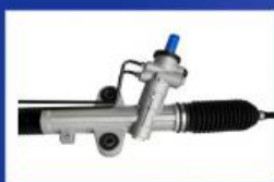
Power Steering Rack