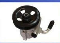
Power Steering Pump