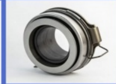
Clutch Release Bearing