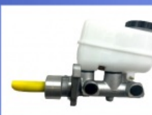
Brake Master Cylinder