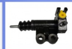
Brake Slave Cylinder