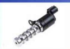
Oil Control Valve