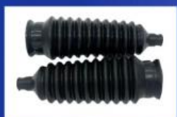
Steering Gear Boots