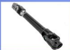
Steering Column Shaft