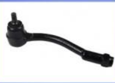
Tie Rod End