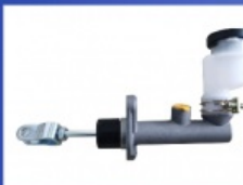
Clutch Master Cylinder