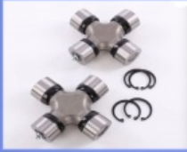
Universal Joint Bearing